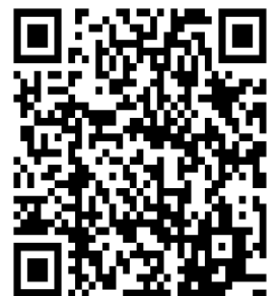
Sample Letter for Households with Children who are Automatically Eligible.