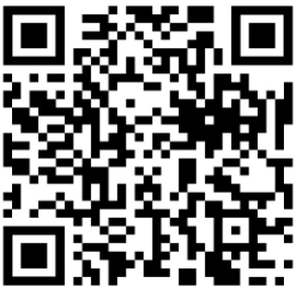
Sample newsletter (multiple languages)